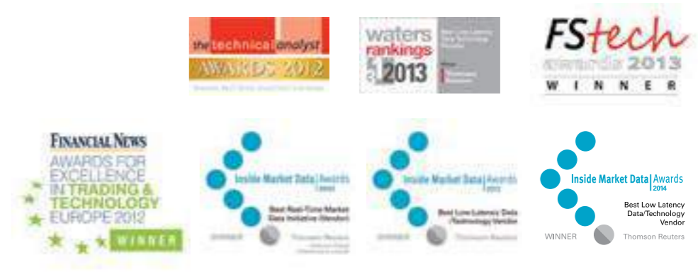
Some industry recognition for Thomson Reuters Elektron

For more information, please visit financial.thomsonreuters.com/elektron