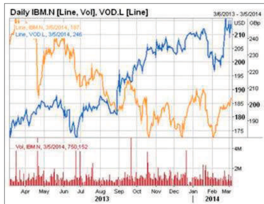
Access to over 200,000 time series instruments. Over 15 different charting analyses and over 45 customizable parameters so charts can be given a unique look and feel.

The Thomson Reuters Knowledge Direct API supports our Digital Solutions offering, which brings together our robust API infrastructure with additional market leading investment tools and capabilities, to deliver leading financial market data, news and analytics to wealth management companies, corporations and fintech developers globally.