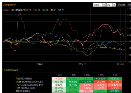
An example of the Chart Analysis available through our partner network.