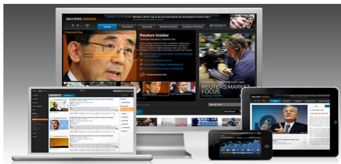
Access multimedia anywhere with mobile devices.