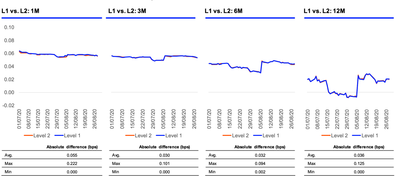
Chart 2: Refinitiv Term SONIA Level 1 vs. Level 2 output

The Level 2 data aligns very closely with Level 1 data. Chart 2 below shows a comparison of the Refinitiv Term SONIA rate generated using Level 1 and Level 2 of the waterfall. The average of the absolute difference between the two levels is low and significantly less than 0.1bps for all four tenors.